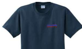
Front with Logo

Available in both men's and lady's T-shirt cuts, men's and lady's tanks, and unisex long sleeves, a selection of colors, and sizes S to XXL sizes. We look forward to your wearing these everywhere and providing us with free Jalapeno advertising and the same time.