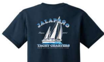
Back Under Sail

We have folks already waiting for the next batch of shirts to be printed. If you are interested in a Jalapeno shirt as part of the pending order, let me know the colors and sizes, and I will get the latest pricing. The last batch was $25 each with shipping.