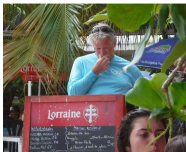
lunch choices, Anse d'Arlet, Martinique

As we were still in the Virgin Islands for much of the summer, we extend our summer availability a bit and were able to do a couple last minute July charters in the new HOT spot for Caribbean charters - the USVI. With the BVI and other islands closed, the charter business in the USVI was booming for two months. Eventually we had to decommission for hurricane season, back in smokey Reno until fall.