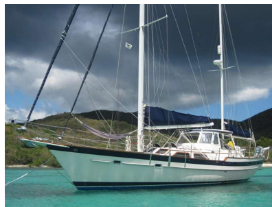
Little Lameshur, St. John, USVI

Since we were not able to take Jalapeno south as planned, the trip we profiled in Airbnb Adventures from Martinique to St. Lucia did not take place this year. Thus, Jalapeno is currently weathering hurricane season in St. Thomas, not in Grenada.